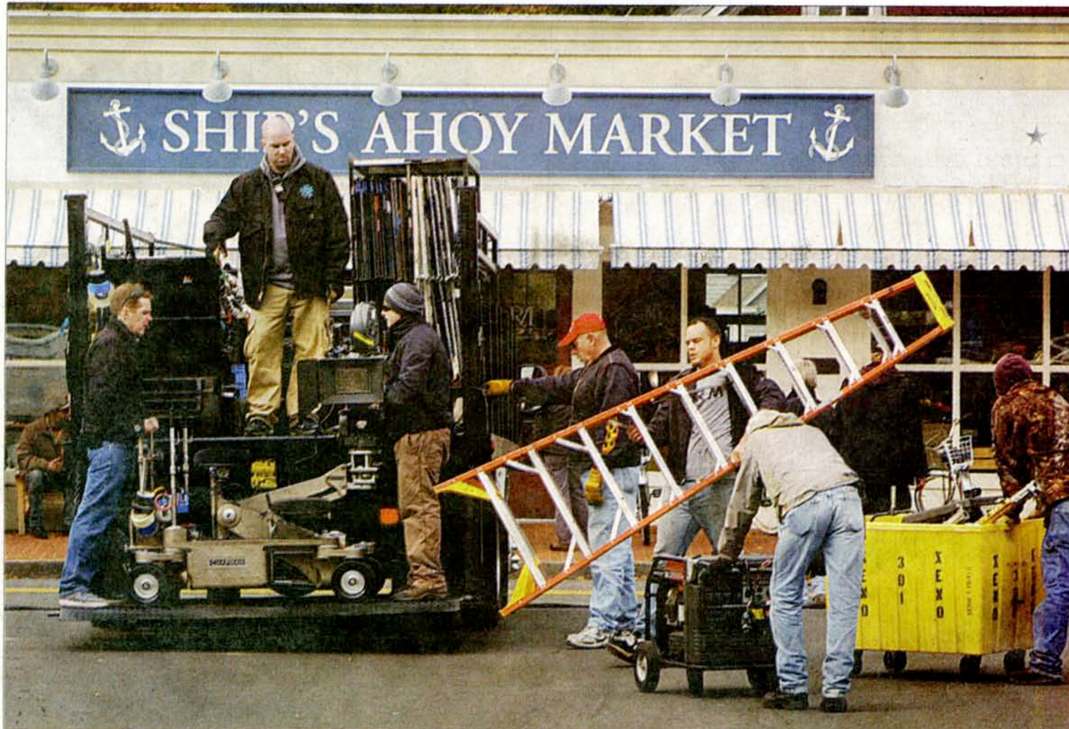
Film crew shooting the motion picture, "We The Peeples," load equipment in front of Rowayton Market, whose name was changed along with other local businesses' names to allow the town to double as Sag Harbor on Long Island.